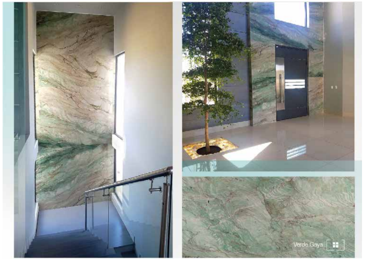
The photos presented in this article are from the Designer's project located in Residencial el Pedregal Hermosillo, Sonora. Material: Green Gaya of Natural Marble

The importance of choosing an Interior Designer is that they advise you to make a project that standardizes the style from its layout. This taking into account an extraordinary time before its foundation to have a clear concept of the idea and that in turn lead to a good choice of materials.